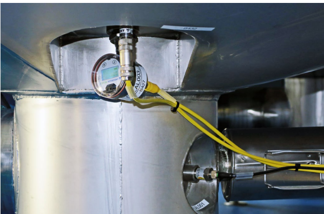
Volume, temperature and level measurement of tank contents with L3, TFP-161 and NCS-M-11