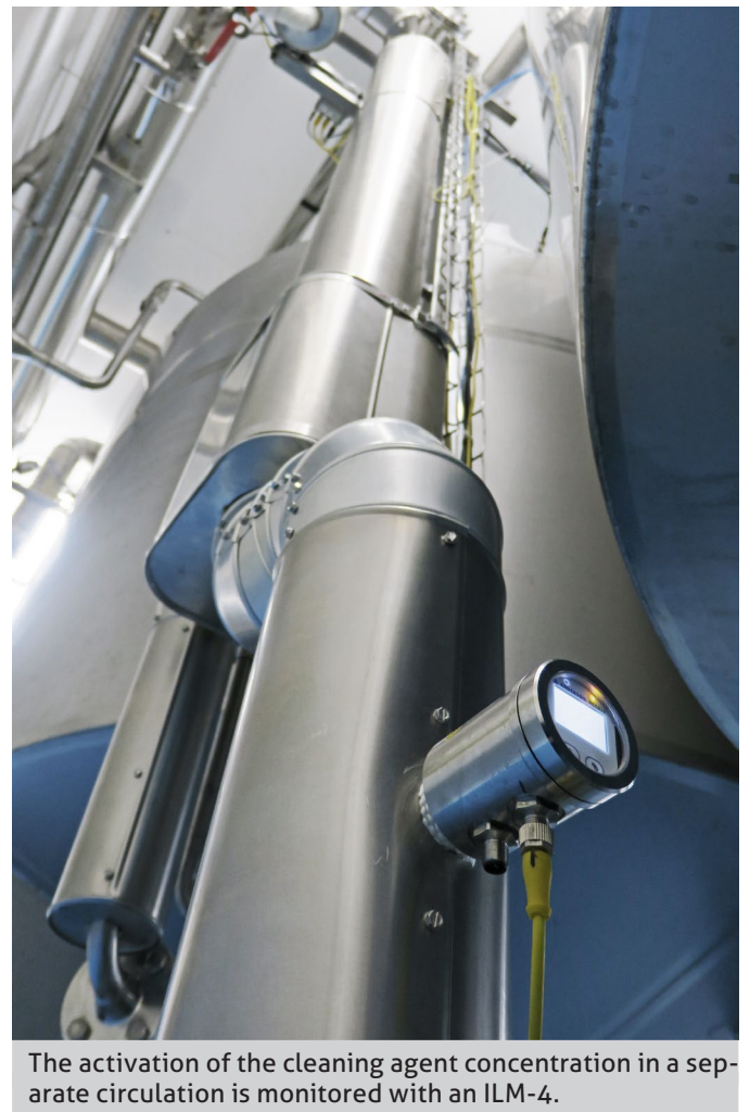
The activation of the cleaning agent concentration in a separate circulation is monitored with an ILM-4.