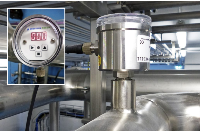
The compact flow monitors FTS monitor the return flow of the media.