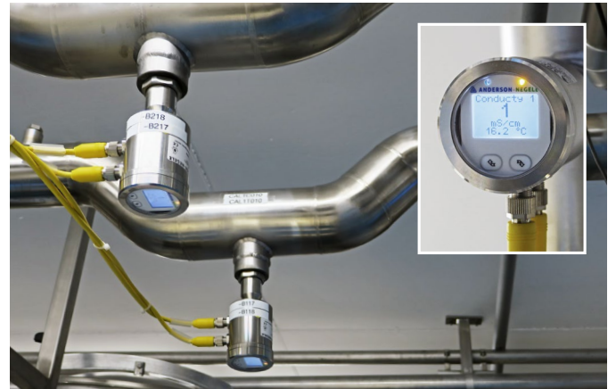
The lowering in each of the three return pipes avoids air bubbles and increases the measuring accuracy of the ILM-4 installed on the underside of the pipe.