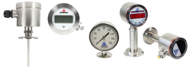
TEMPERATURE & PRESSURE

Contact your Regional Technician or your local Anderson-Negele Distributor to schedule a service appointment.