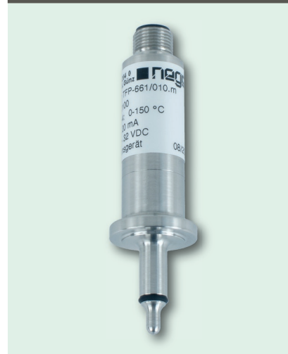
Fig. 4: Temperature sensor TFP-661 for PHARMadapt EPA

tion certificate 3.1 as per EN 10204 is available. To achieve optimal measuring results, the build-in pipes are available in lengths that match the respective nominal pipe diameters.