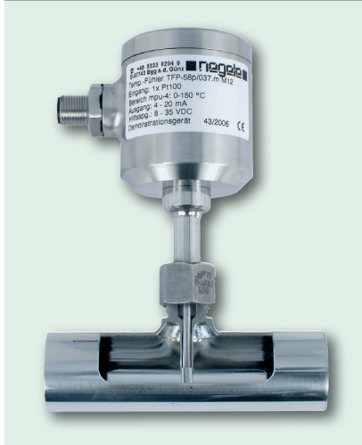
Fig. 1: Temperature sensor TFP-58P with build-in system ESP-G DN25