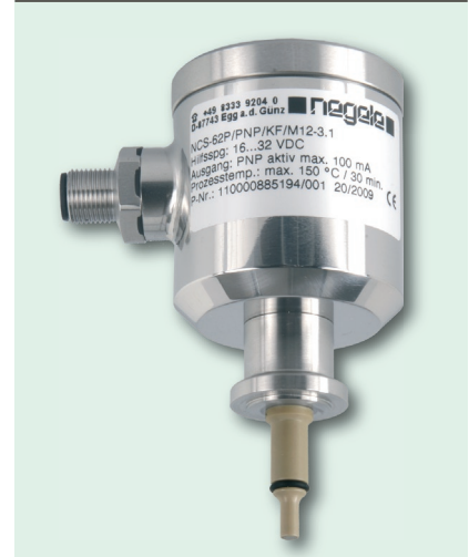
Fig. 5: Level switch NCS-6xP for PHARMadapt EPA

tion certificate 3.1 as per EN 10204 is available. To achieve optimal measuring results, the build-in pipes are available in lengths that match the respective nominal pipe diameters.